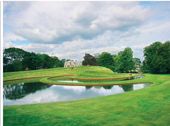
Figure 4. Charles Jencks. Landform Ueda in Edinburgh (Scotland).

Man-made landforms are also used in the process of restoring areas affected by industrial production. Man-made landforms as a leading method in landscape design became the basis for Charles Jencks’s work on the creation of Northumberlandia garden in the north of England (2005–2012). The work was commissioned by the British Coal Company during the expansion of the Scottish National Gallery of Modern Art (SNGMA). This project was created within the framework of transformation of industrial areas (not far from it there is a coal mine and a quarry where red clay is mined). The design solution made it possible to turn a large quarry into a landscape with an expressive composition of giant mounds and artificial lakes. The huge sculpture of lying goddess of the Earth, about 35 m high and about 400 m long, is a conceptual and compositional organizing element of the landscape (Fig. 4).