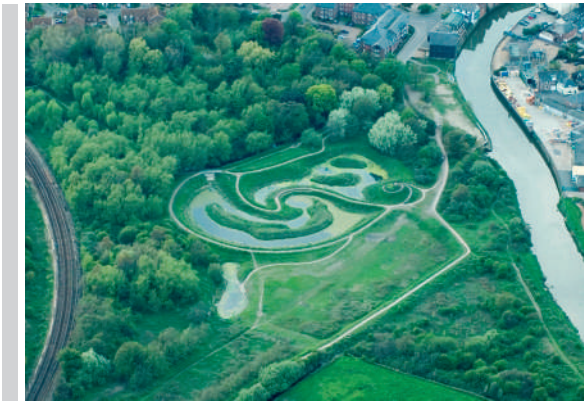
Figure 1. Chris Drury. Heart of Reeds in Lewis (East Sussex, United Kingdom).

area of about 2.5 hectares is intended to restore wetlands of the Lewes Railway Land nature reserve in the center of Lewis (East Sussex, United Kingdom) [20] (Fig. 1). The territory on which the reserve was located more than 50 years ago was a railway sorting hub, and it turned into a wild forest with a river flowing through it after dismantling the railway line. As a prototype for the design of earth mounds, between which there is water, a model of blood flow in a human heart was taken, forming two spiral vortices. Such a choice of prototype, in the artist's opinion should symbolize relationship of a person with environment (Fig. 2). The concept stipulates that water levels can be adjusted using a sluice gate, and proposed idea allows two halves of the territory to be isolated from each other for separate flow of water. Constantly flowing water flows away from meadows into the pond. The author proposed two spiral paths for visitors of the park that allow ascending to the species points on embankments and the hill for a