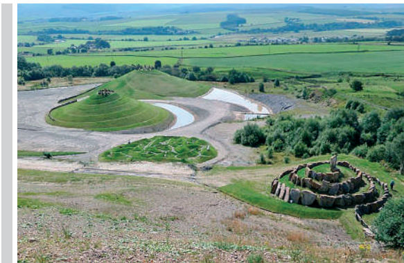
Figure 5. Charles Jencks. Crawick Multiverse. Landforms: Multiverse (foreground); Supercluster (centre); Milky Way and Andromeda Galaxy Mounds (Scotland).

tural and recreational site. The author of the project positions it as a land-art project, which is based on cosmological themes. Each element of landscape composition symbolizes a certain part of the Universe and processes occurring in it. Compositions that resemble both comet collisions, a black hole in the center of the Andromeda galaxy and the Milky Way were created with the help of stones and man-made landforms. Boulders used in the project give the landscape a similarity to megalithic structures. The complex consists of a flat road, at the edges of which stone boulders are set in rows; two spiral mounds, two separate stone pillars with a viewing platform and an amphitheater that can accommodate up to 5 thousand people (Fig. 5). It is symbolic that the official opening of this park took place on the day of the summer solstice on June 21, 2015.