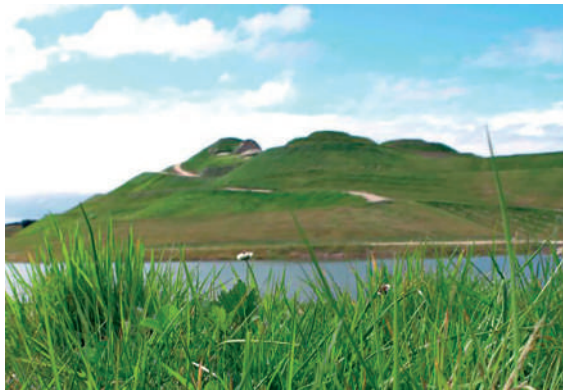
Figure 3. Charles Jencks. Northumberlandia (England)

Identical utilitarian function of protection against the noise of a country road is carried out by the project “Landform Ueda” (1999–2002) in Edinburgh. It is carried out by Charles Jencks for the Gallery of Modern Art, which is part of the National Gallery of Scotland. The architect has created a new space by changing flat lawn with man-made landforms. The landscape composition combines a stepped mound in the form of an elongated crescent and a body of water. The embankment representing the stretched letter “S”, is steeply inclined towards the road, and on the opposite side, by gentle terraces, goes down to the water. This zone is offered as a resting place for visitors where they can sit and walk. Flowing lines of the composition begin from the hill and continue into the earthen mound passing through the lake. In the design of the author’s interpretations, rethinking of smooth outlines of natural formative materials is read (Fig. 3).