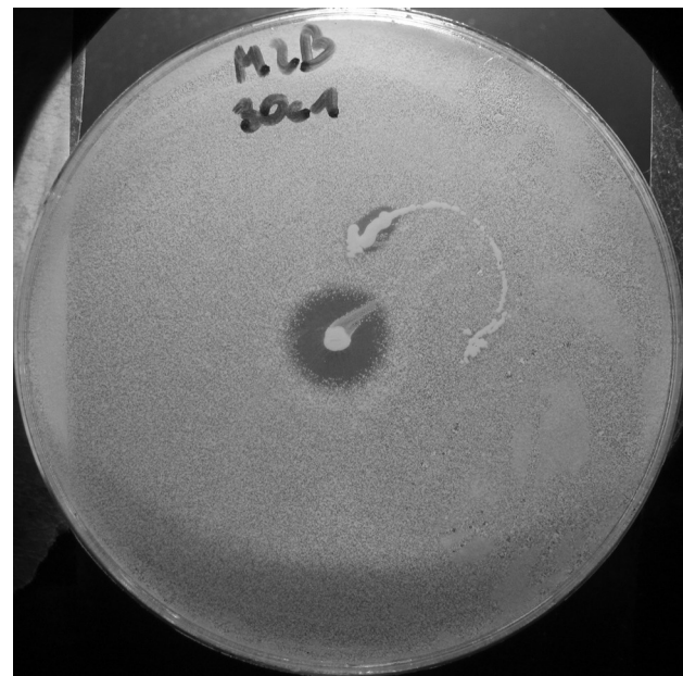
Fig. 1. Growth inhibition zone around the colony of producer strain M2B; an indicator strain – S. aureus 30C1.

Conditions for the effective production of the putative bacteriocin by S. xylosus M2B in a liquid culture were optimized in the terms of medium type, time period and incubation temperature. Comparison of