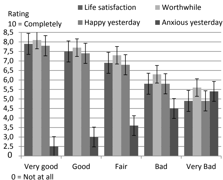
Figure 2. Average subjective well-being, by self reported health, 2012/13 United Kingdom

Figure 2 displays an analysis which compares self-reported health with subjective well-being. The graph clearly shows that those in very good health have the highest life satisfaction, highest sense that the things they do in life are worthwhile, highest happiness, and the lowest anxiety.